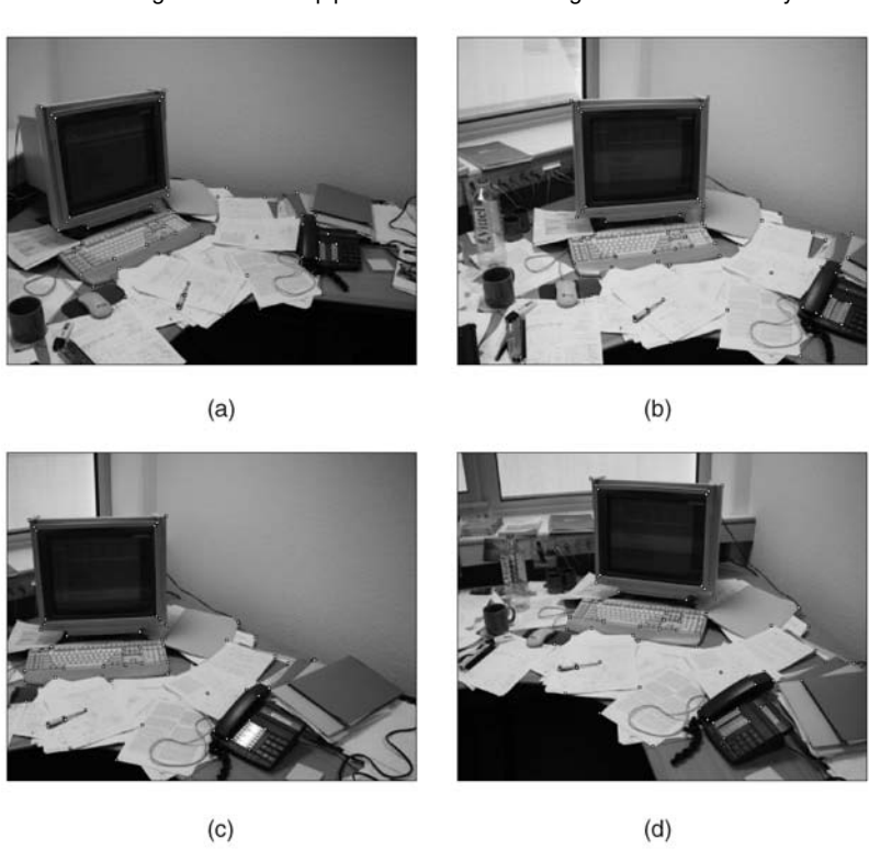
TABLE 4 Reprojection Error at Convergence, \mathcal{E} , and CPU Time to Convergence, \mathcal{T} , Obtained When Combining Pairs of Images to Obtain Epipoles Close to the Images or Toward Infinity

We use different pairs of the images shown in Table 4, in order to cover all possibilities for the epipoles to be close to the images or at